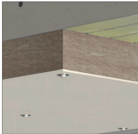
Aesthetically pleasing finish